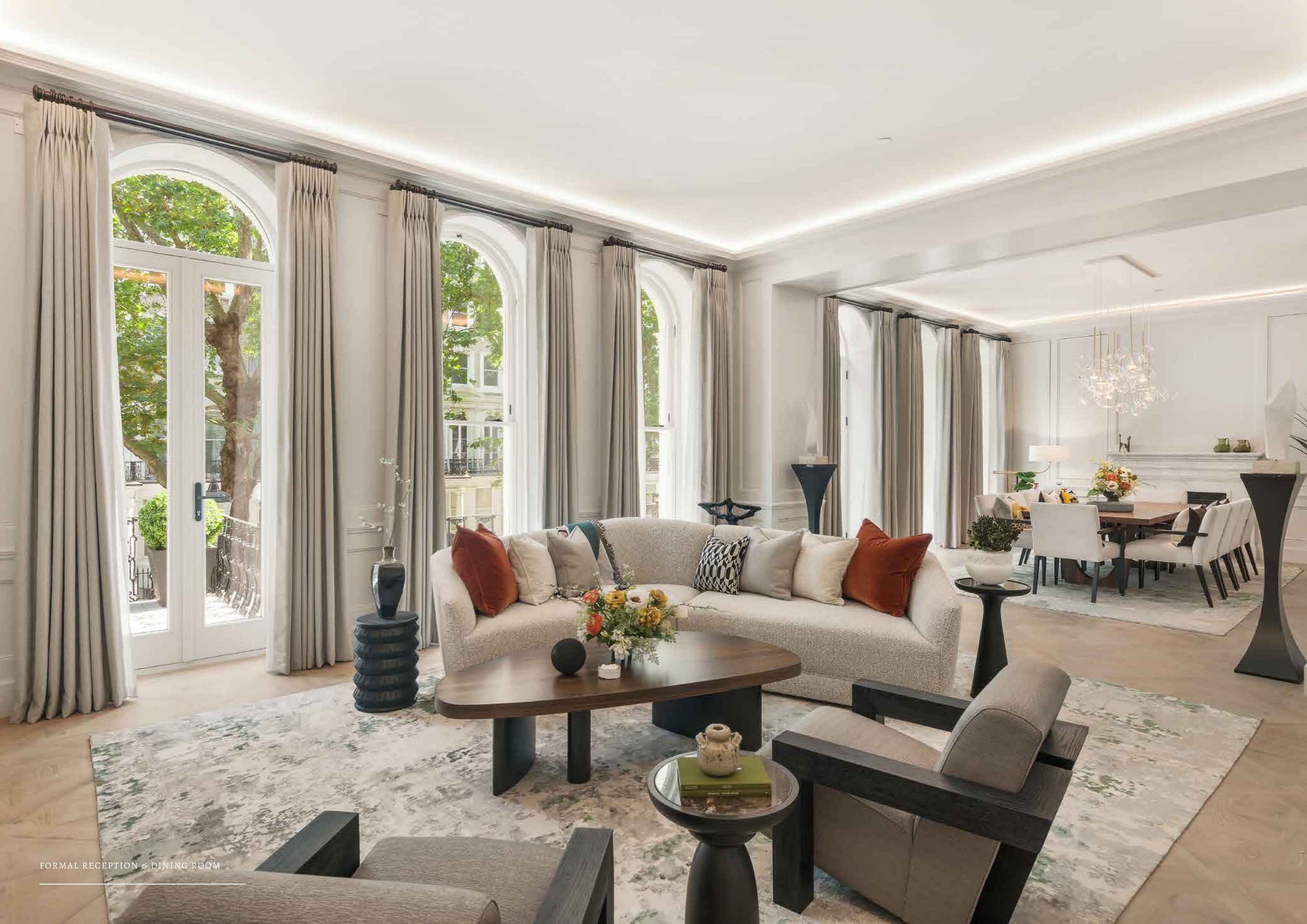
FORMAL RECEPTION & DINING ROOM