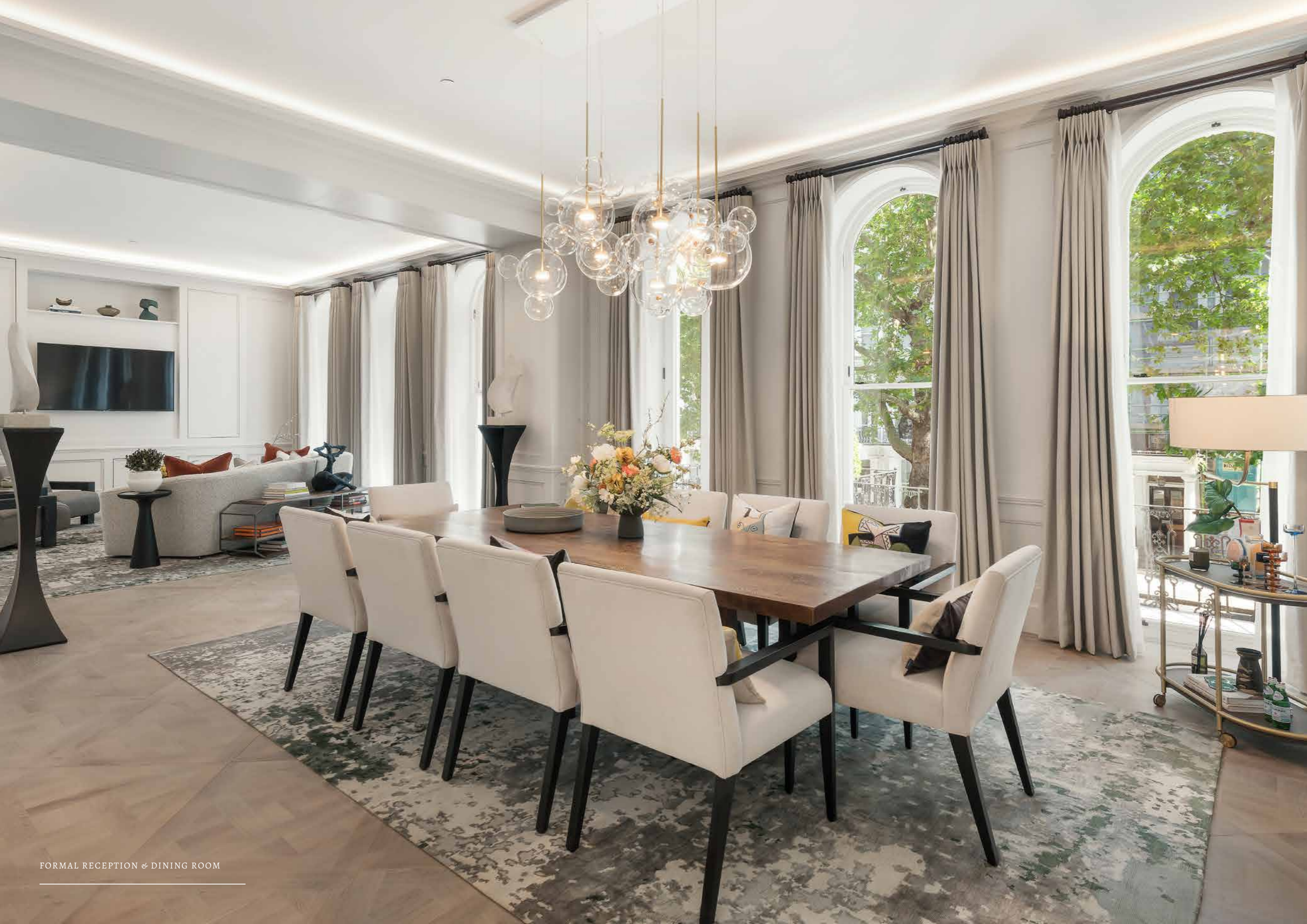
FORMAL RECEPTION & DINING ROOM