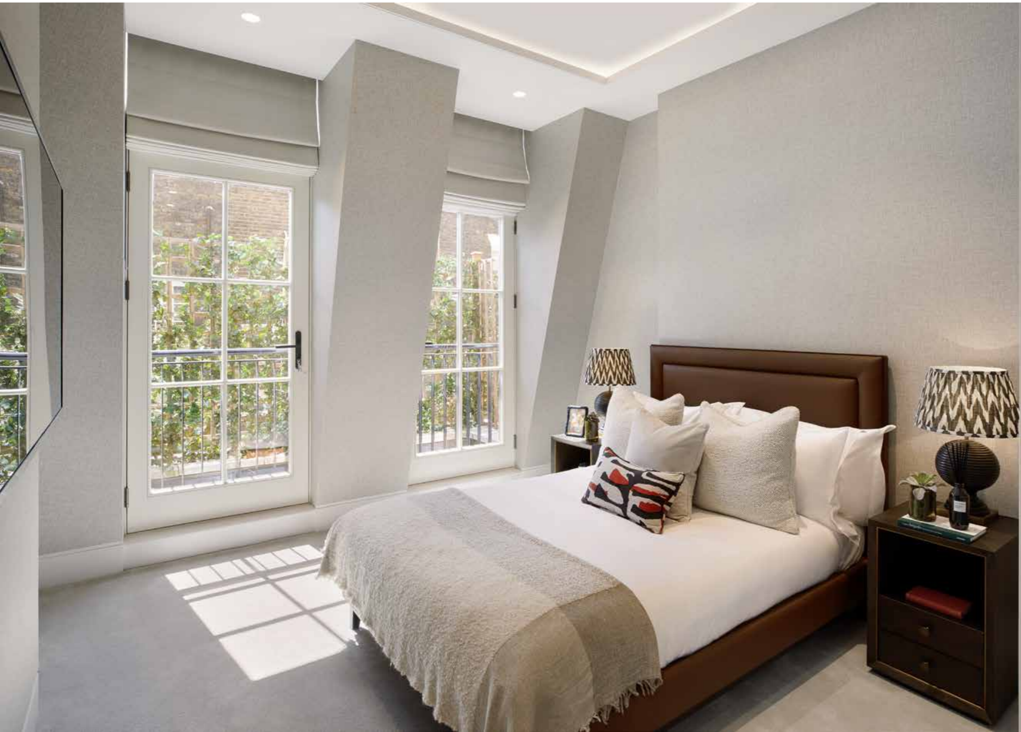
GUEST BEDROOM SUITE 1