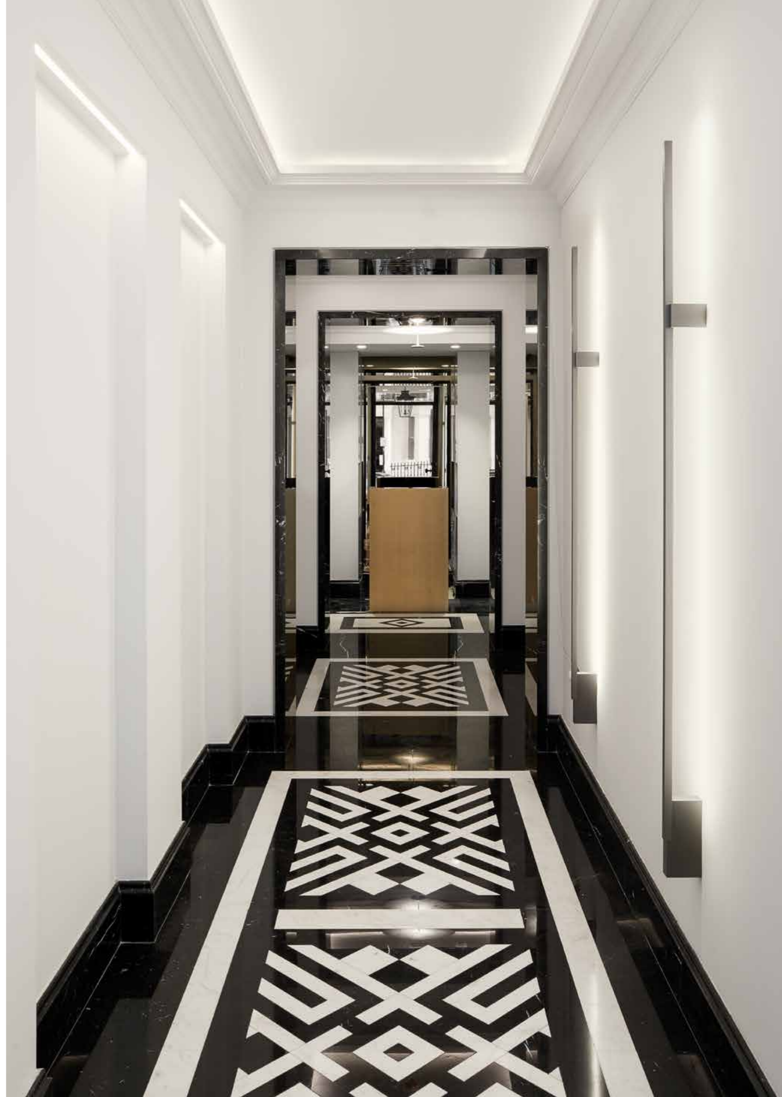
ENTRANCE & COMMUNAL HALLWAY