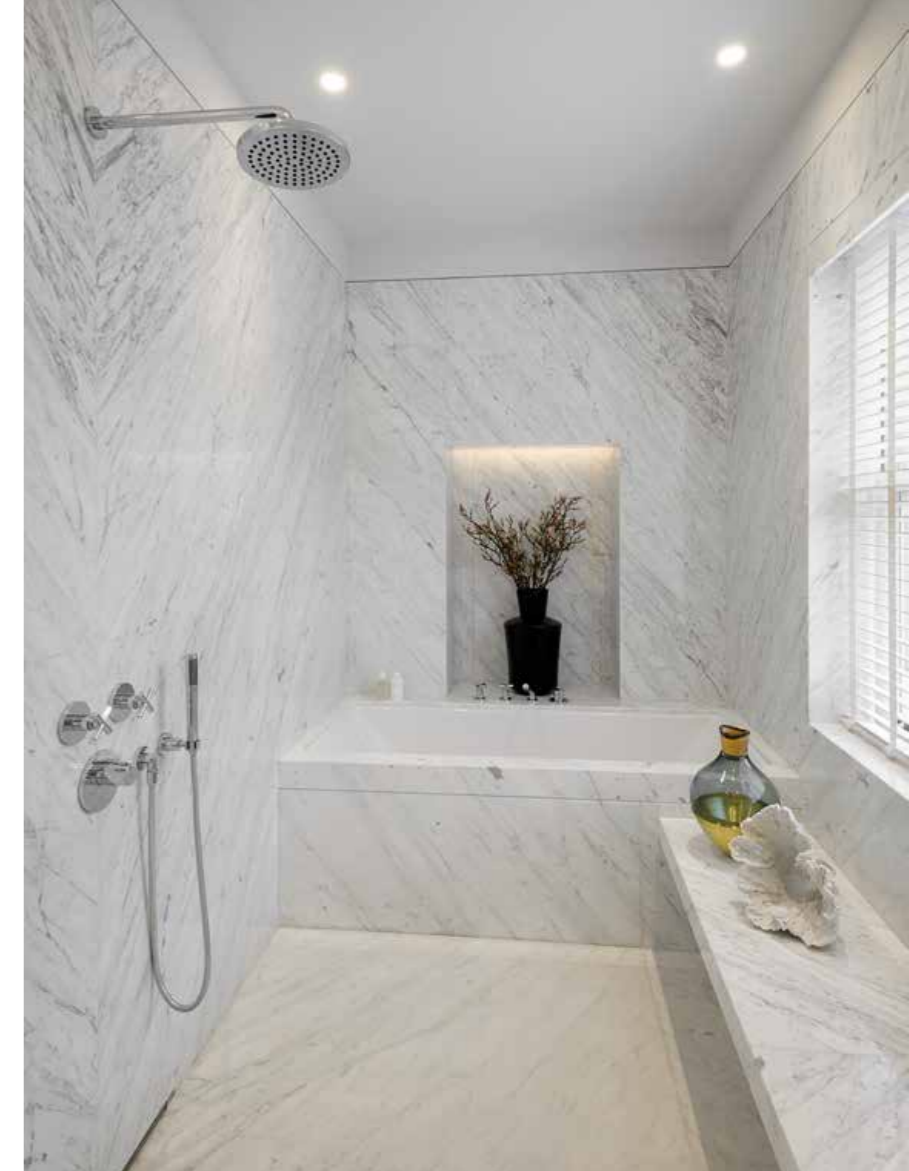
PRINCIPAL EN SUITE BATHROOM