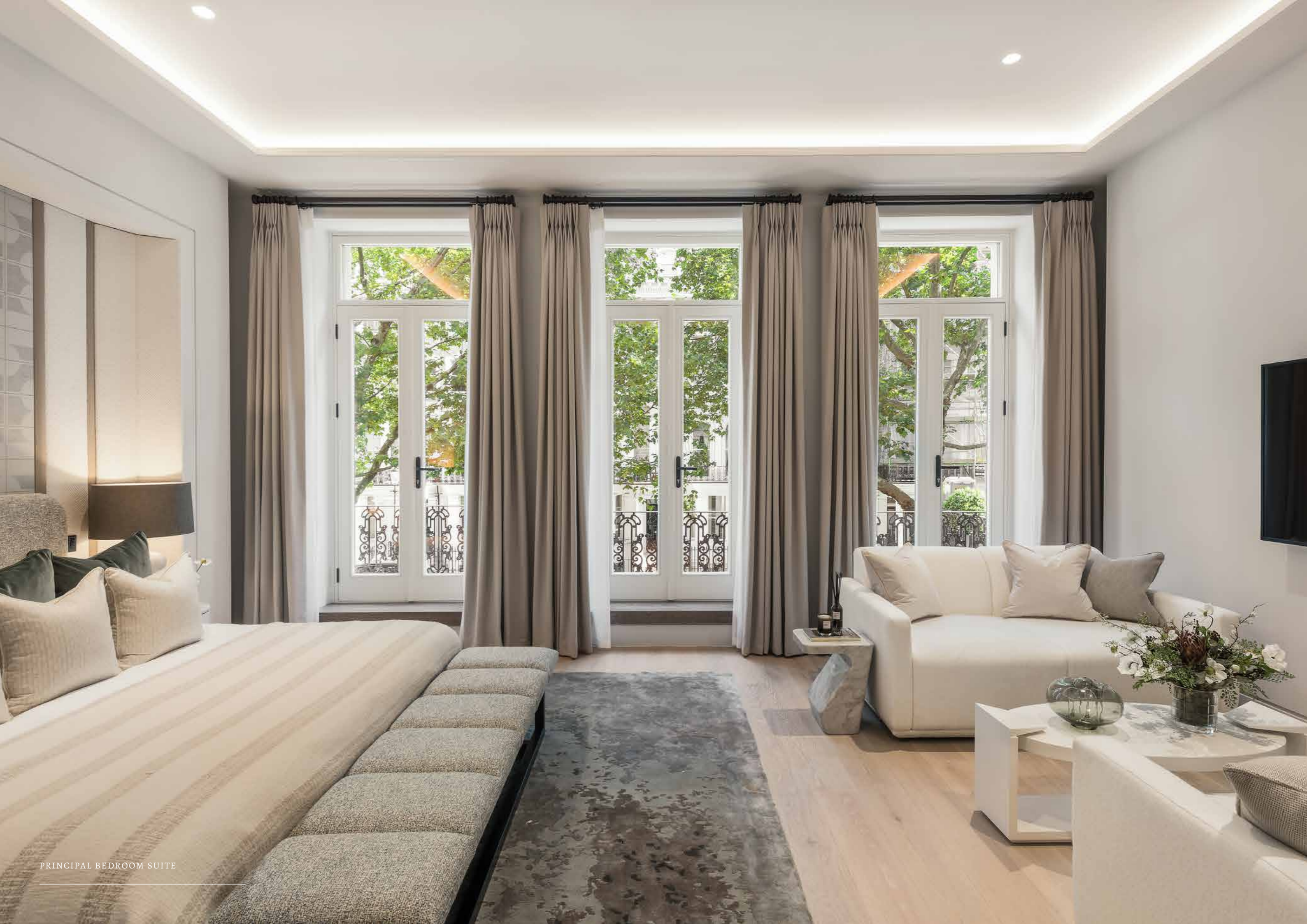
PRINCIPAL BEDROOM SUITE