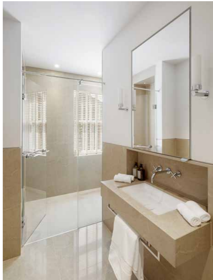
GUEST BEDROOM SUITE 2