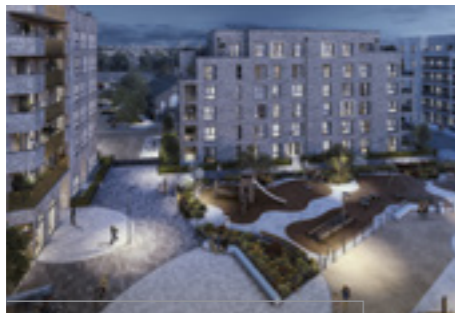
ROCHESTER RIVERSIDE, ROCHESTER

From the character of the homes we build to the planning of environments and the unique detailing of the landscape, our creative approach to place making creates places where people feel at home, providing a greater sense of belonging, spirit of neighbourhood and quality of life for everyone who lives in and around our developments. We create places people love.