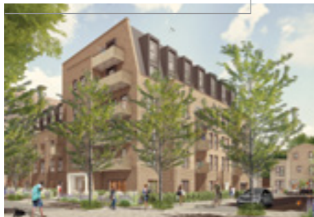
NEW AVENUE, OAKWOOD, LONDON