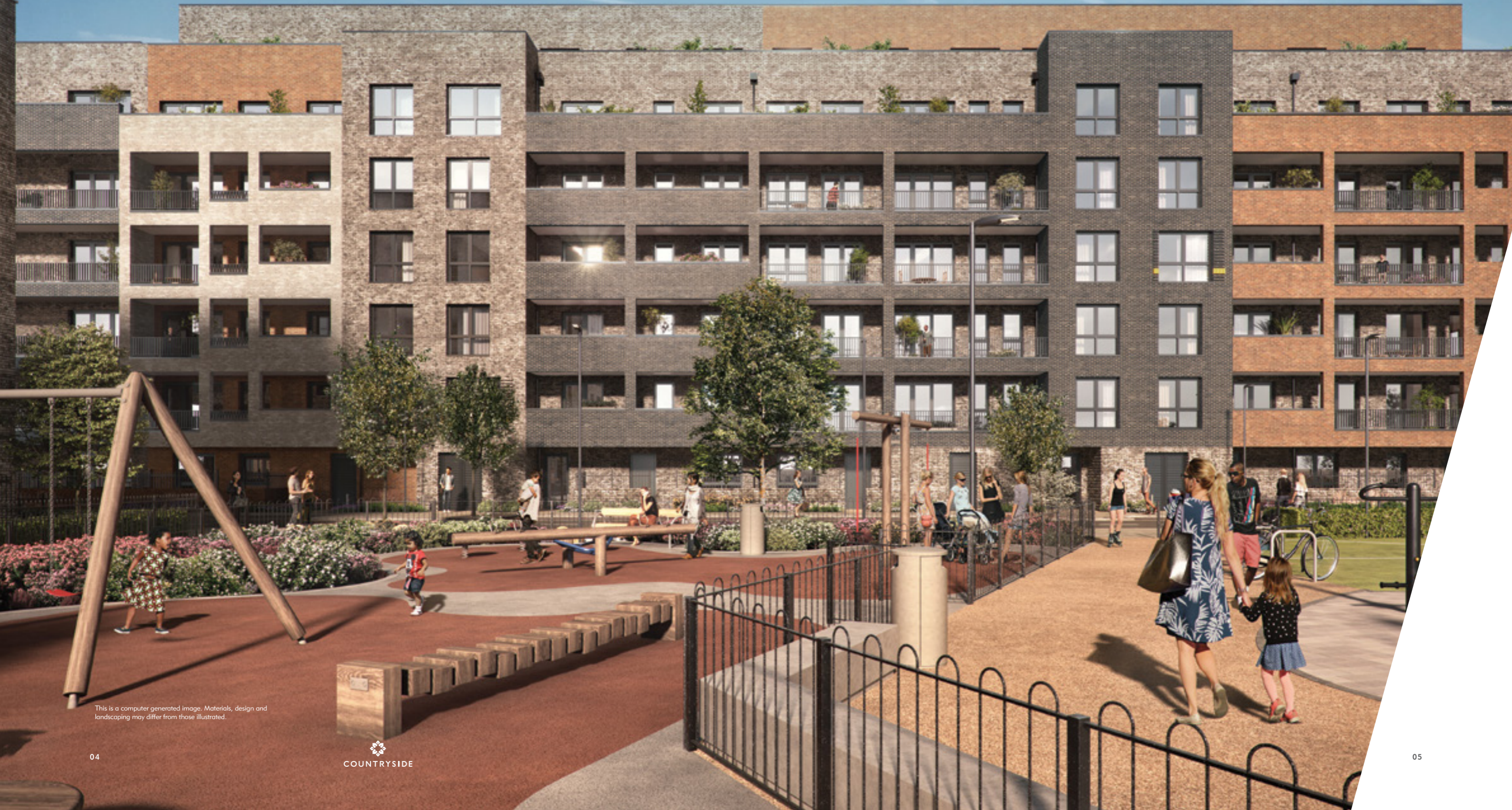
This is a computer generated image. Materials, design and landscaping may differ from those illustrated.

SCENE 2'S POSITION IN THIS DYNAMIC, DIVERSE AND HISTORIC PART OF NORTH-EAST LONDON MEANS YOU CAN FULLY ENJOY ALL OF THE AREA'S MANY OPTIONS FOR EATING, DRINKING, SHOPPING AND TRAVEL. THE UK'S INCREDIBLE CAPITAL PROVIDES THE PERFECT BACKDROP FOR A COMFORTABLE, CREATIVE, WELL-CONNECTED LIFESTYLE.