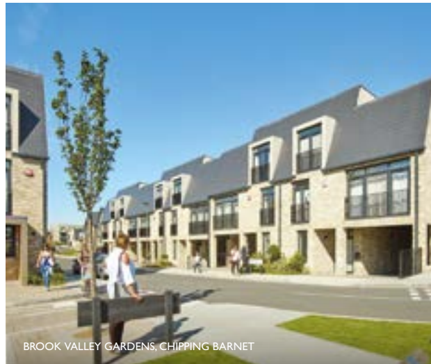
BROOK VALLEY GARDENS, CHIPPING BARNET