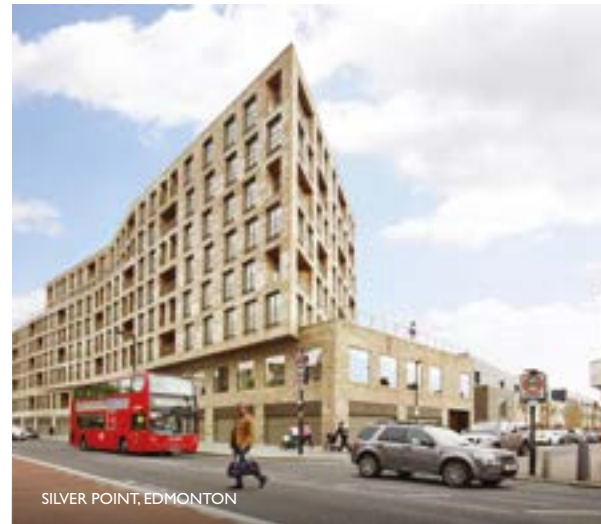
SILVER POINT, EDMONTON