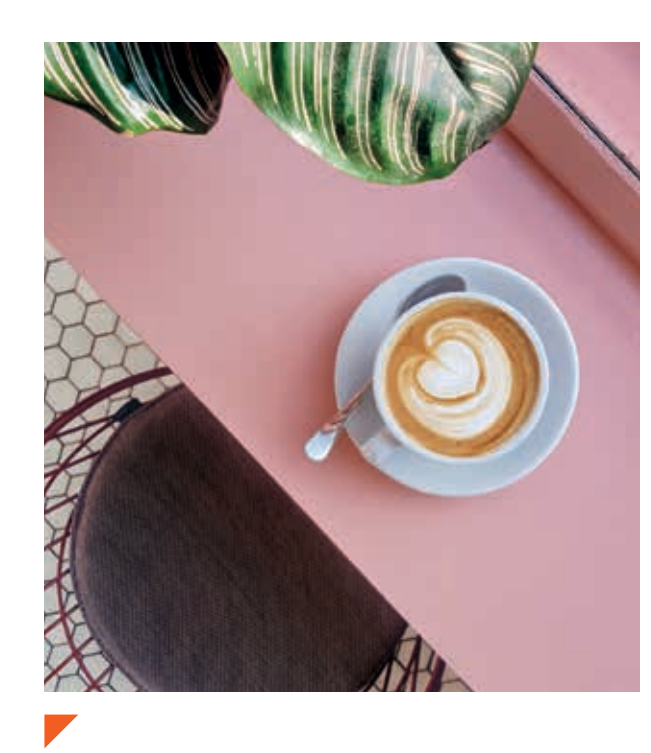
Oh My Coffee Shop & Larder