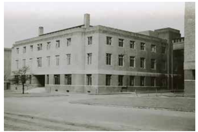
Guinness factory in 1936, from something small...