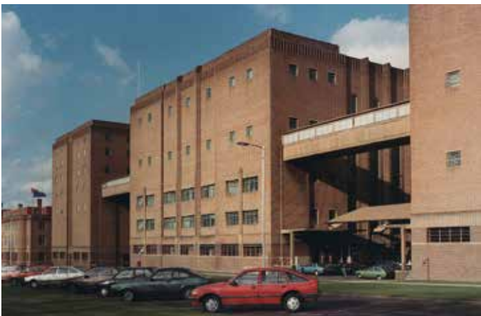
Outside the Guinness factory, 1990