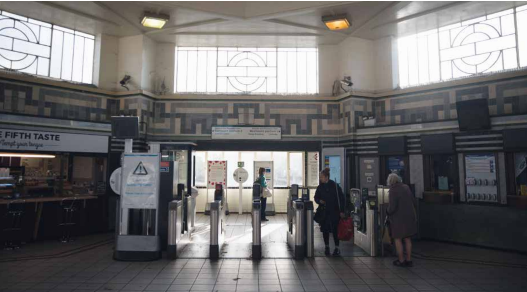
Ealing Common Station, Piccadilly Line