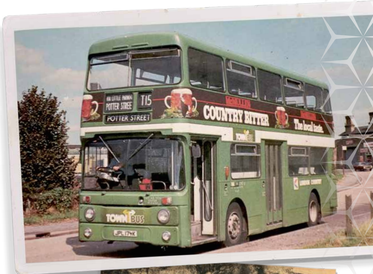
All aboard the T15 on the Leyland and Atlantean route on Park Royal, 1980