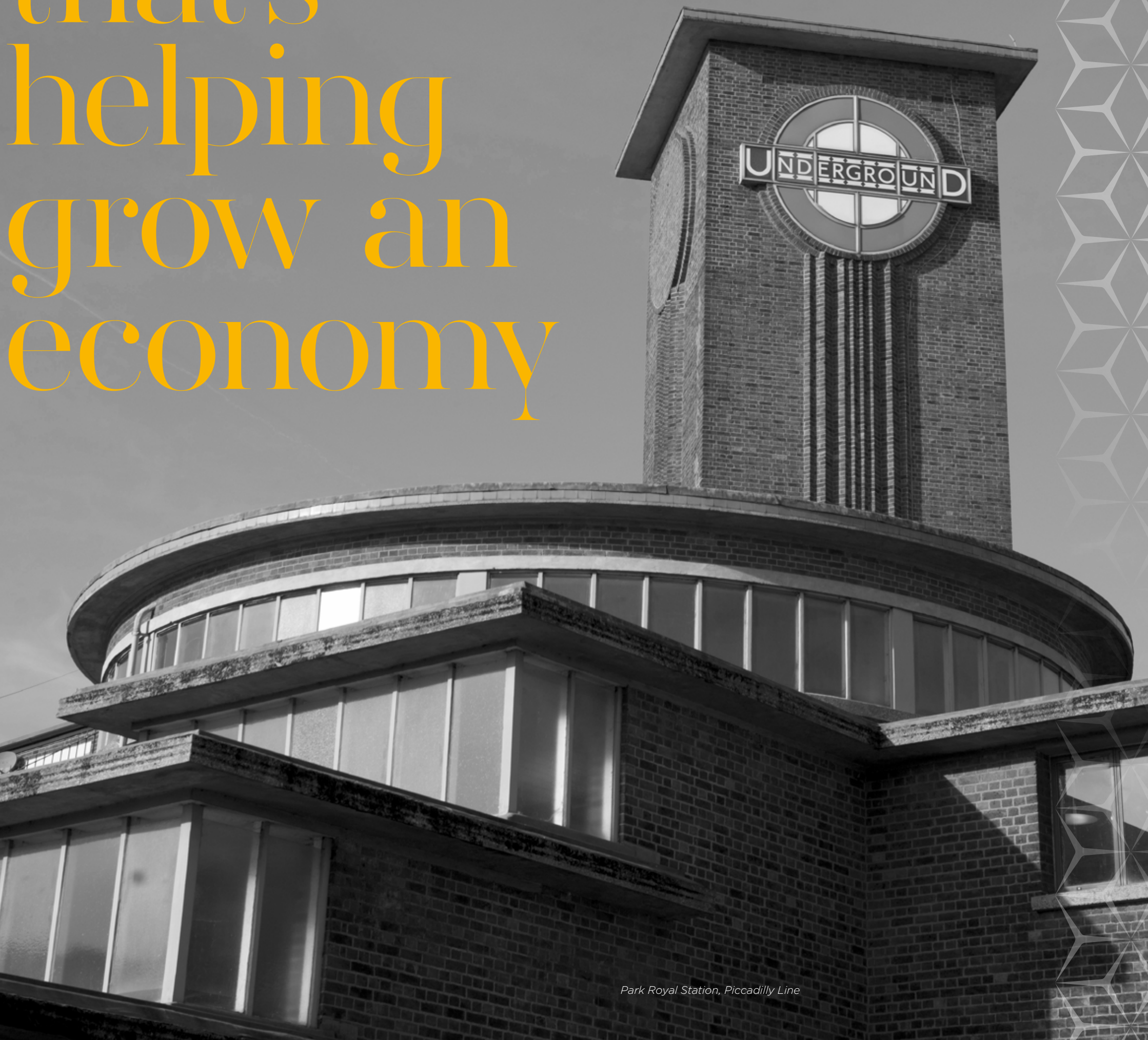
Park Royal Station, Piccadilly Line