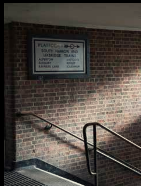
All trains to Uxbridge on the Piccadilly Line

It will contribute £7 billion to the UK economy every year, create 65,000 new jobs, build 25,500 new homes and provide access to two new 'super hub' railway stations.