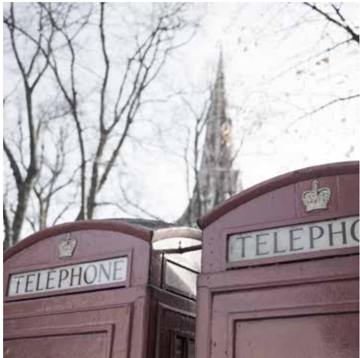
Turnham Green, Chiswick