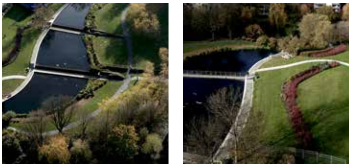
Turnham Green, Chiswick

The history of the Regency Heights land might be distinctive with the amazing things that are happening there now.