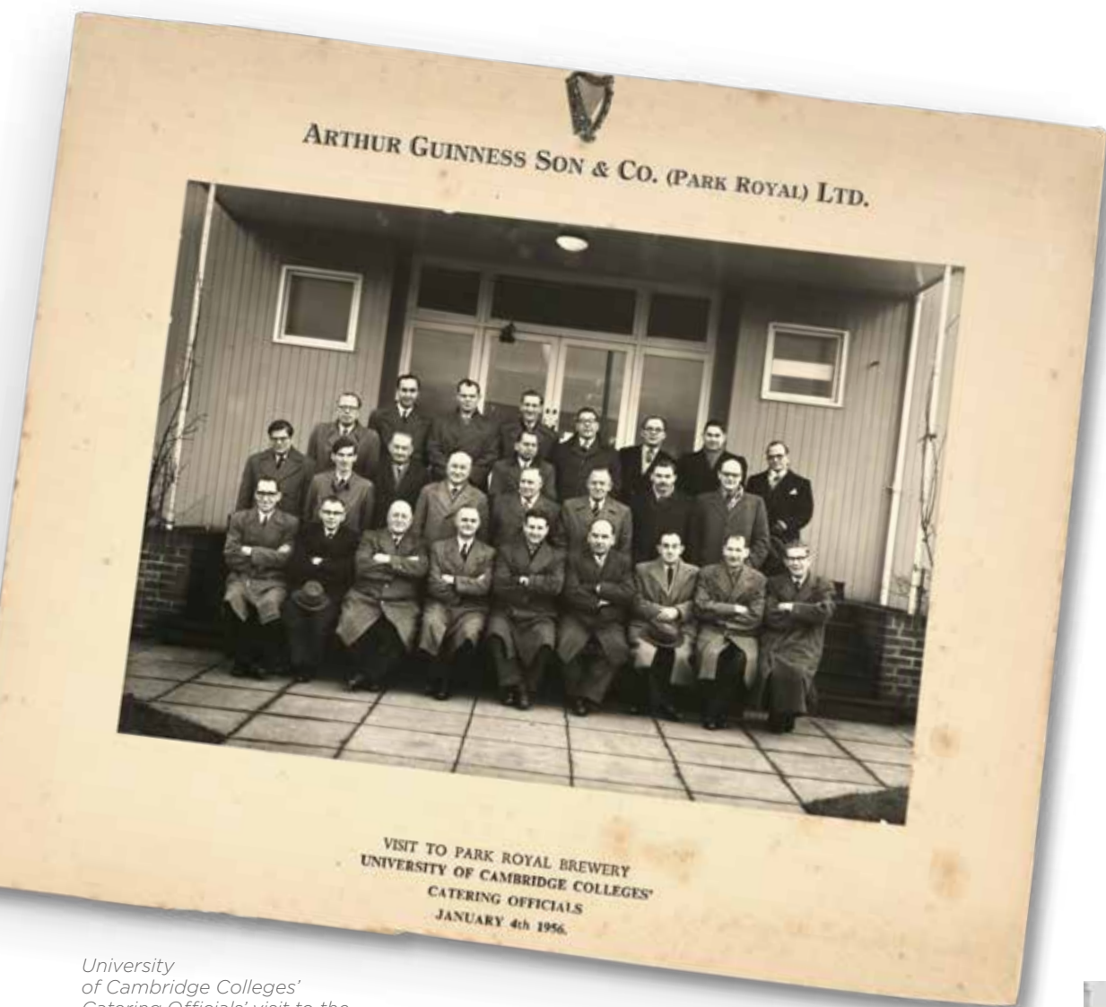
University of Cambridge Colleges' Catering Officials' visit to the Guinness factory, Park Royal in 1956

Then, in 1933, it was transformed into the Park Royal Guinness brewery.