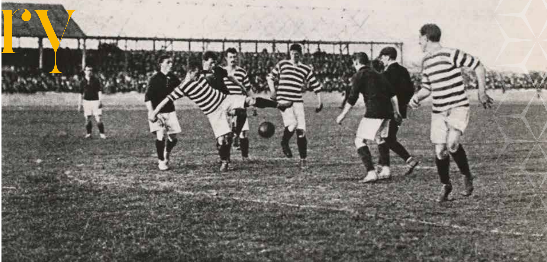
Queens Park Rangers vs Plymouth Argyle