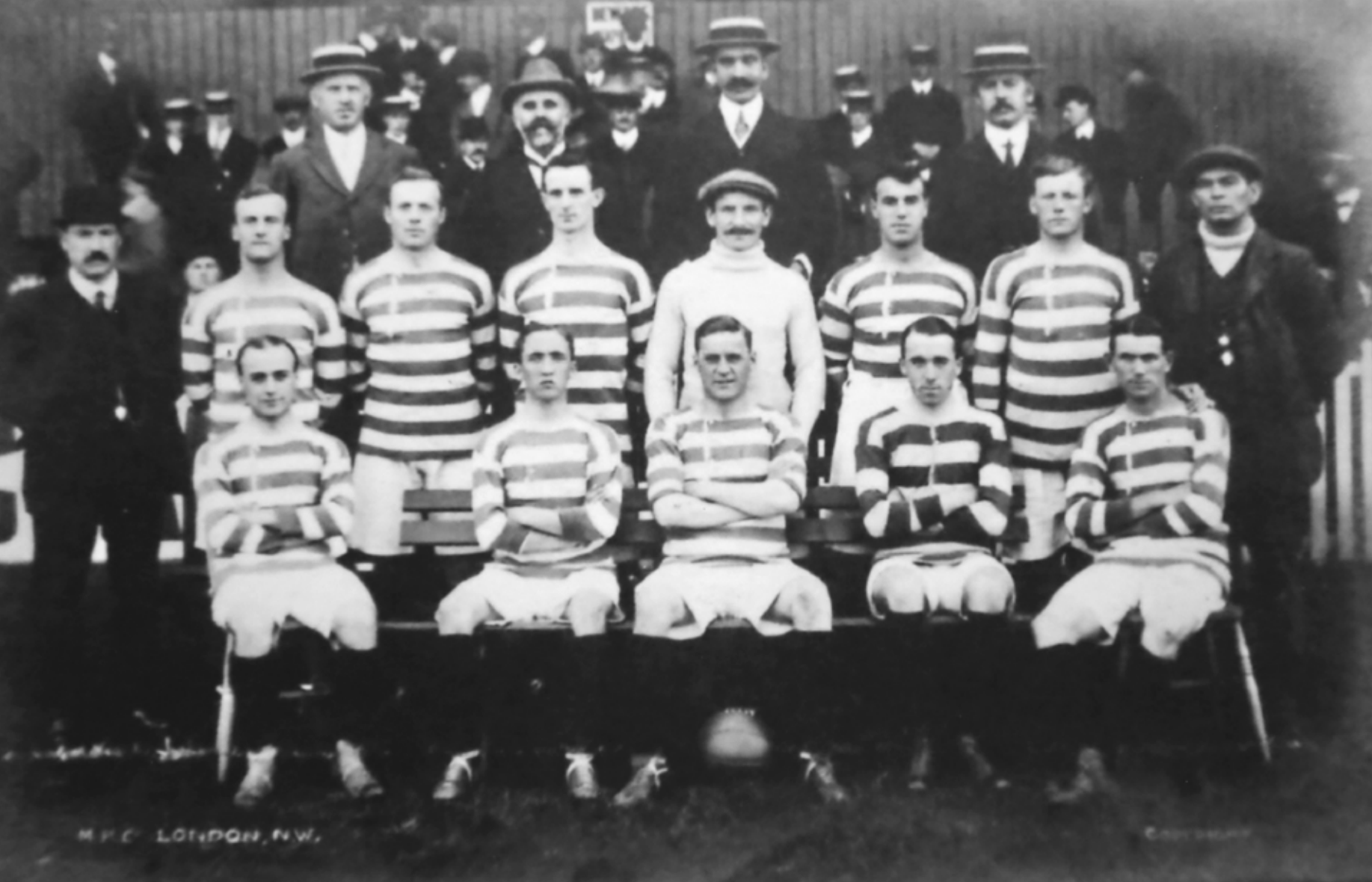
QPR team photograph, early 1900s

It's been a showground, home to the football club... Queens Park Rangers.