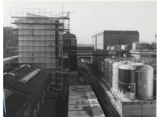
...to something more in 1970