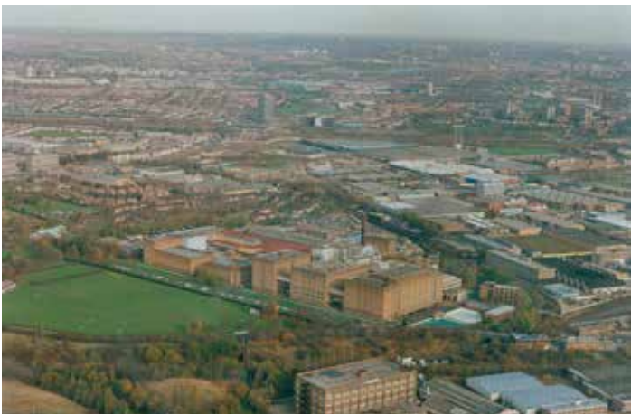
Aerial view of the Guinness factory and sports field, 1991