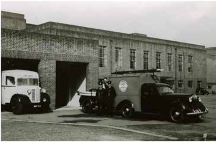
Guinness vehicles parked at the factory, 1936