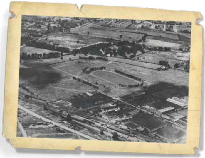
View of Park Royal looking North, 15th June 1933

Every piece of land has a past and a story to tell.