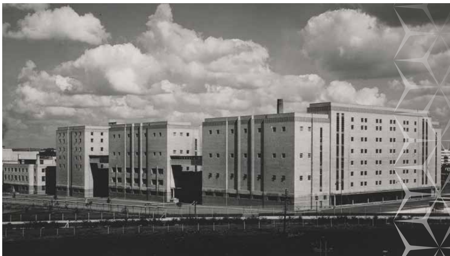
Guinness factory at Park Royal, 1950

But this wasn't the end, the next exciting chapter is just being written.