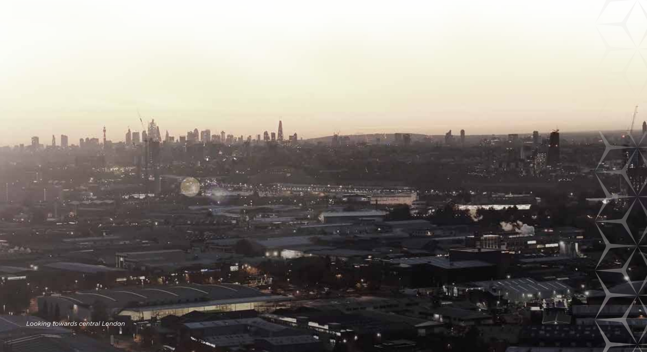
Looking towards central London