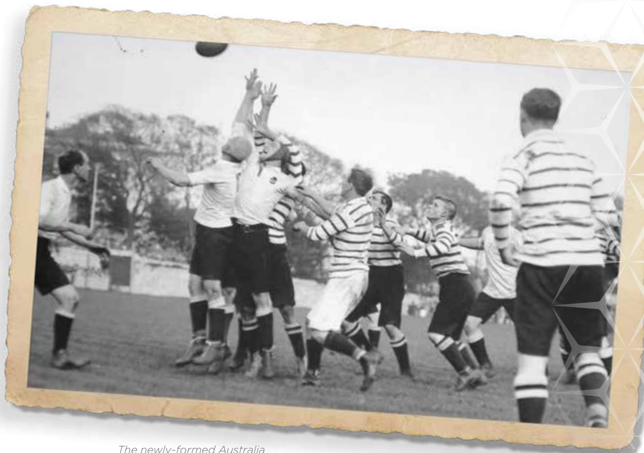
The newly-formed Australia rugby league team on the 'Kangaroo' tour of Great Britain, 1908