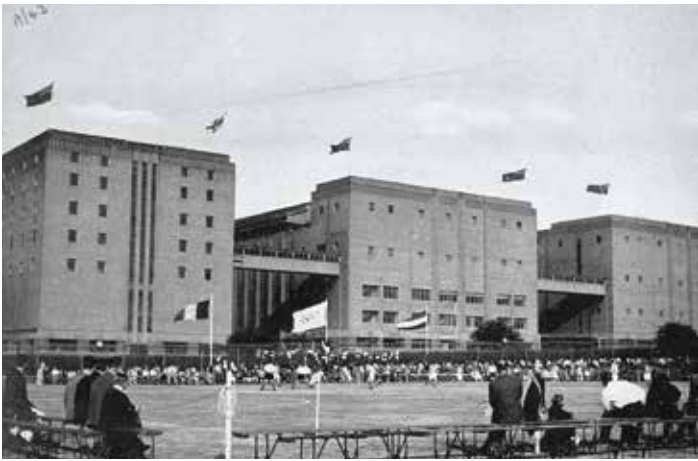
Belgium vs Holland preliminary hockey match at the XIV Olympic Games, 1948