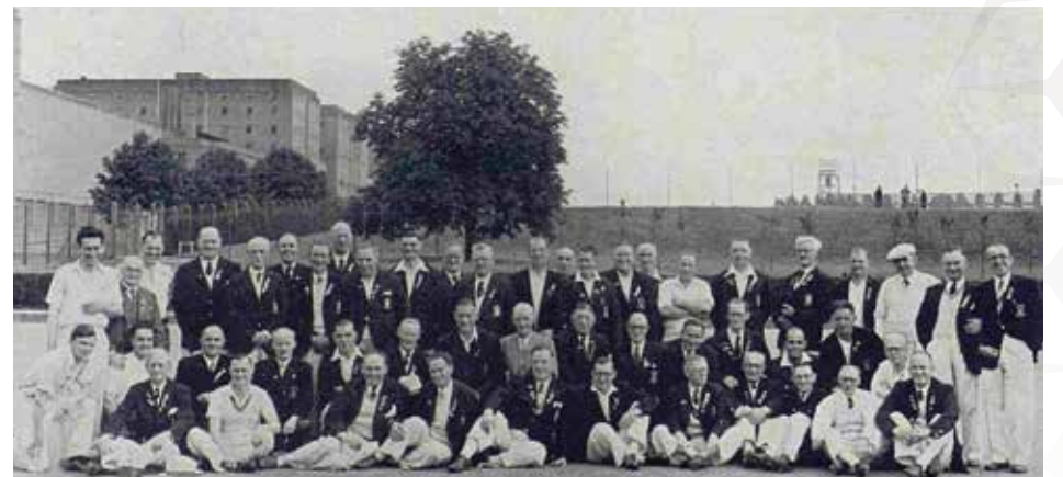
Irish Bowling Tourists and the Guinness Bowling Club team at a match, Park Royal, 25th June 1948