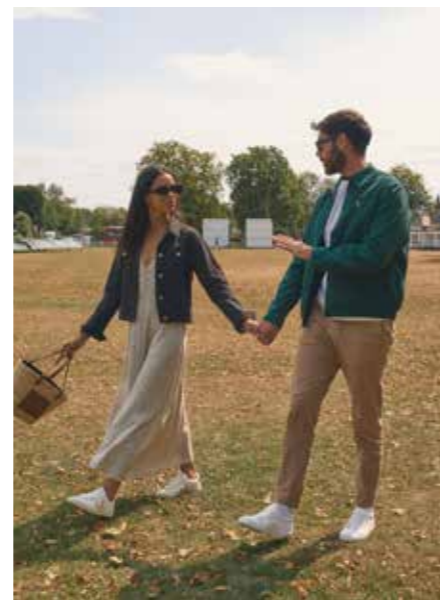
4 MIN WALK TO TWICKENHAM GREEN