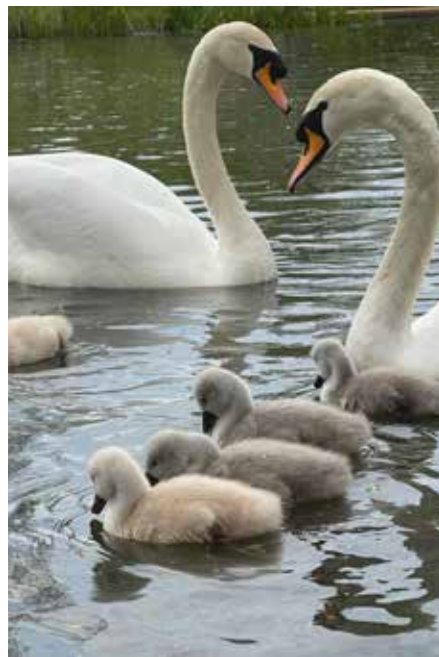
LOCATED NEXT TO THE RIVER CRANE