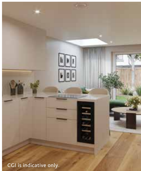
CGI is indicative only.