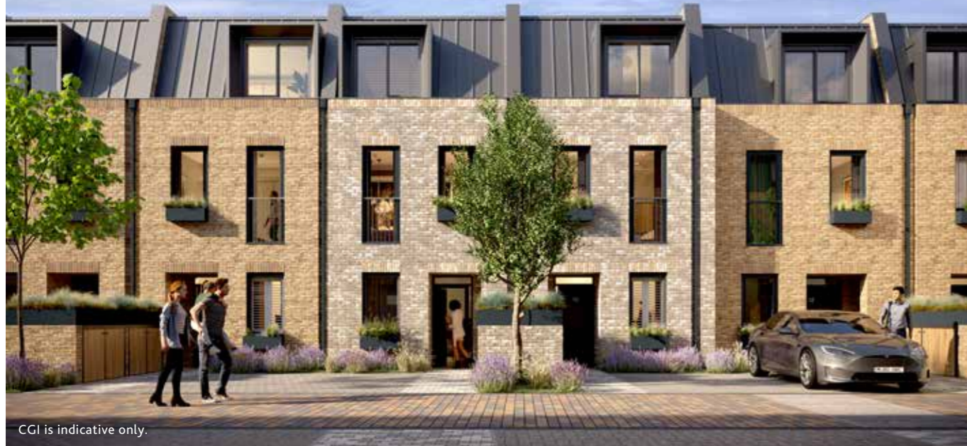
CGI is indicative only.