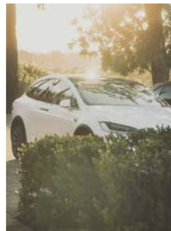
PRIVATE CAR PARKING